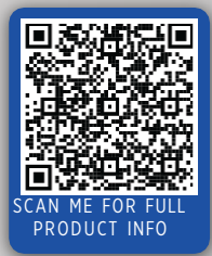
SCAN ME FOR FULL PRODUCT INFO

CONTACT (843) 457-0595 WWW.PATRIOTCONNECTIONSPPE.COM